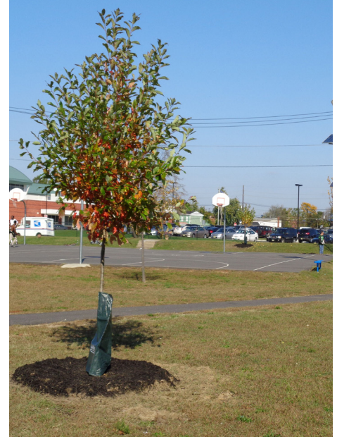
Blackgum trees provide shade in Reverend Evers Park.

THE NJ TREE FOUNDATION is a statewide non-profit organization dedicated to planting trees in New Jersey's urban communities. Since 2002, the NJ Tree Foundation has worked in the Camden area, improving the environment and transforming neighborhoods with more than 6,500 trees.