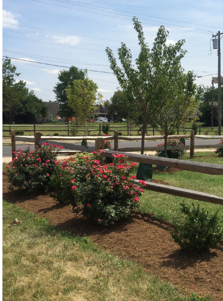
Cherry Trees and White Pines add beauty to a reclaimed lot on 2nd St. & Erie Street.