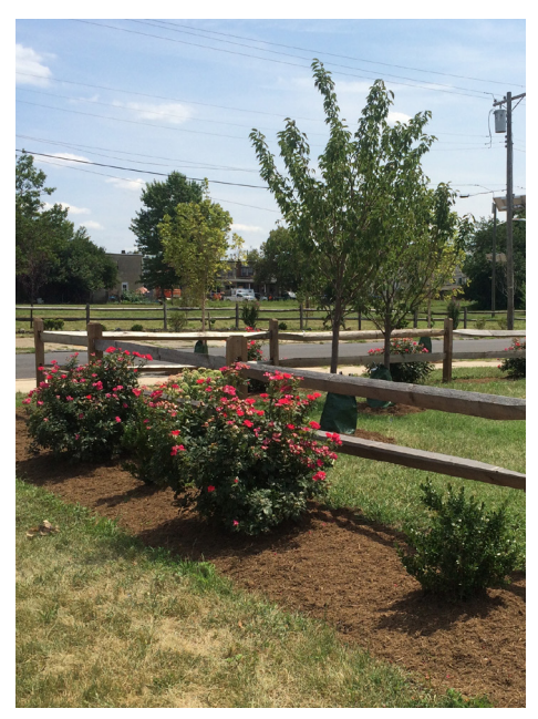
Cherry Trees and White Pines add beauty to a reclaimed lot on 2nd St. & Erie Street.