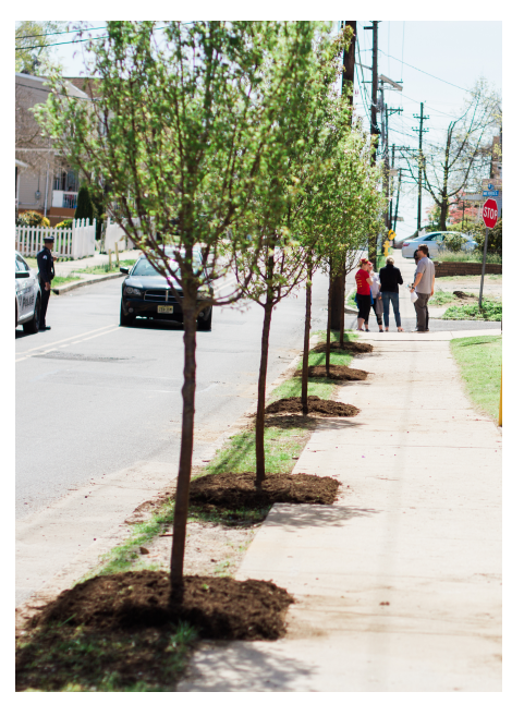
Perfectly planted street trees line 36th Street in East Camden.

THE NJ TREE FOUNDATION is a statewide non-profit organization dedicated to planting trees in New Jersey's urban communities. Since 2002, the NJ Tree Foundation has worked in the Camden area, improving the environment and transforming neighborhoods with more than 7,200 trees.